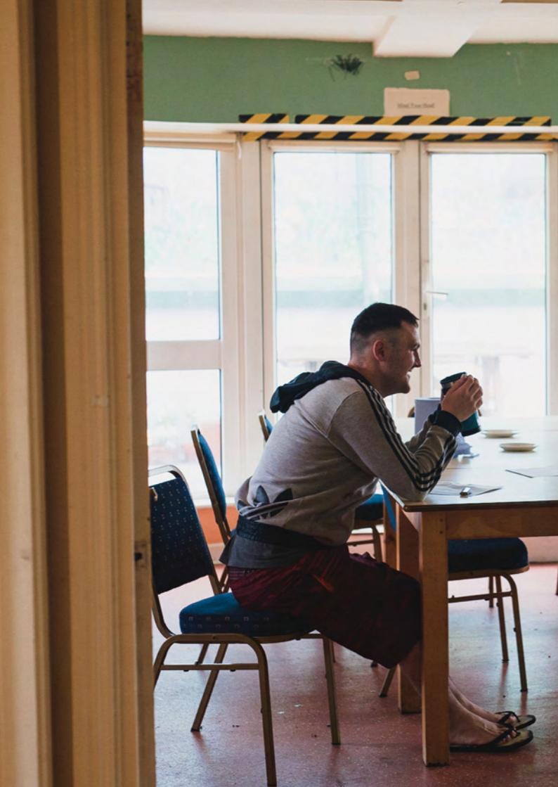
Service user at Depaul's Orchid House Service