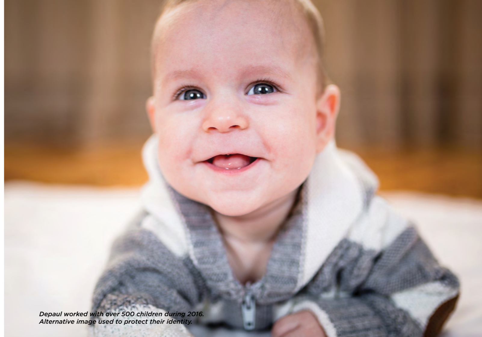
Depaul worked with over 500 children during 2016. Alternative image used to protect their identity.