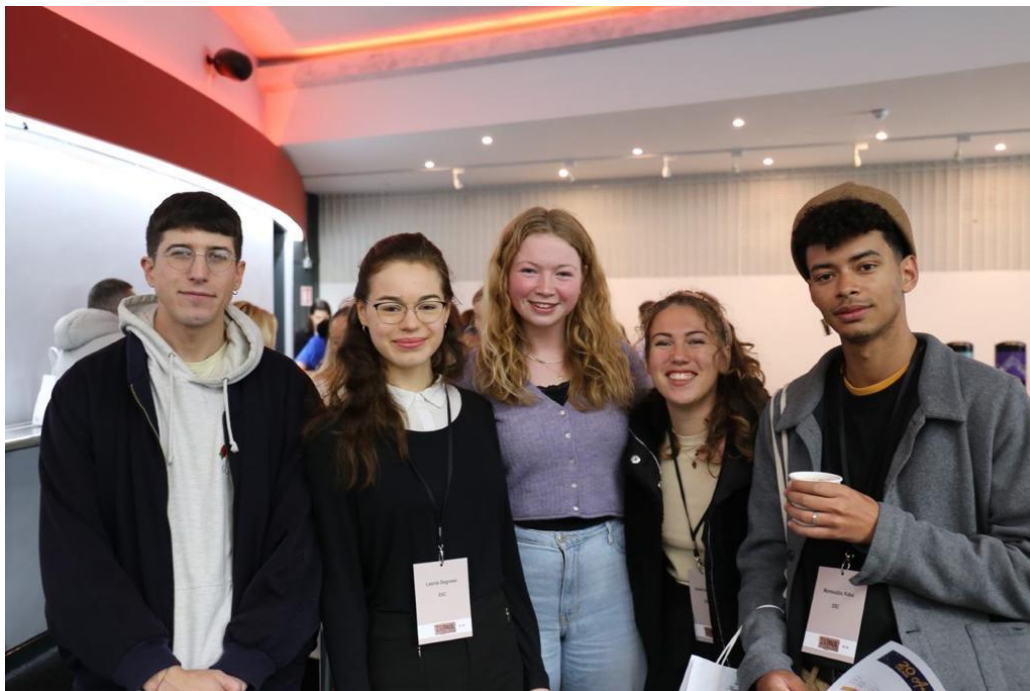
Some past ESC participants at Depaul's 20 th anniversary celebrations